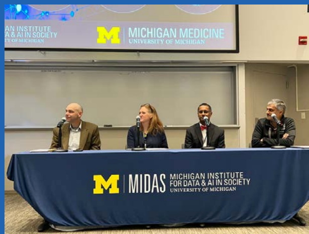
Panelists at “GenAI Governance and Sensitive Data Use Guidelines at Michigan Medicine”