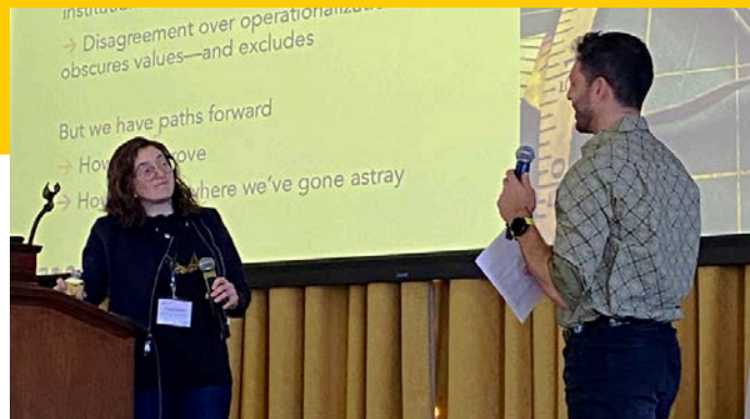
Attendees of the Summit collaborate on a presentation

The annual Future Leaders Summit (FLS) brought together outstanding graduate students and postdocs from major research universities, Midwest universities and Minority-Serving Institutions, engage them in research discussions and provide mentoring as they grow to become future research leaders in data science and AI.