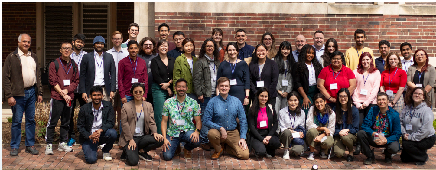
Caption: Future Leaders Summit Cohort 2024

A diverse pool of career mentors offered advice from effective networking and job search to interview skills and to being a successful junior faculty member.